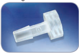
Large Bore Luer F