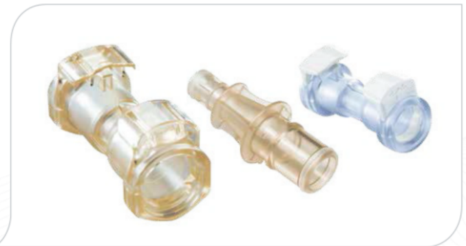
Figure 1: MPC/MPX back-to-back adapters give end users the flexibility of connecting single-use systems that feature identical coupling connections at the end of their tubing.

Any time a component requires a specific mating component, finished-goods inventory needs can more than double, or even triple. As an example, consider an assembly as simple as a basic transfer line with sterile connectors on each end. There are three possible configurations depending on the application set-up: a female-to-male version, a male-to-male version and a female-to-female version (see figure 2).