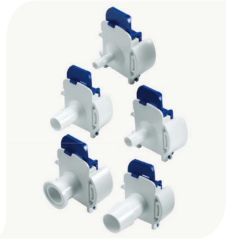
CPC's interchangeable AseptiQuik® genderless connectors enable tubing transitions between tubing of different sizes, from 1/4" to 3/4" flow.

Just as single-use technology emerged in response to market demands, so too have genderless single-use connectors. Systems designers and processors have maximized the benefits of single-use and hybrid processes — those of increased flexibility, faster changeovers and reduced costs. Now the bioprocessing industry can also benefit from the reduced components complexity afforded by genderless connectors.